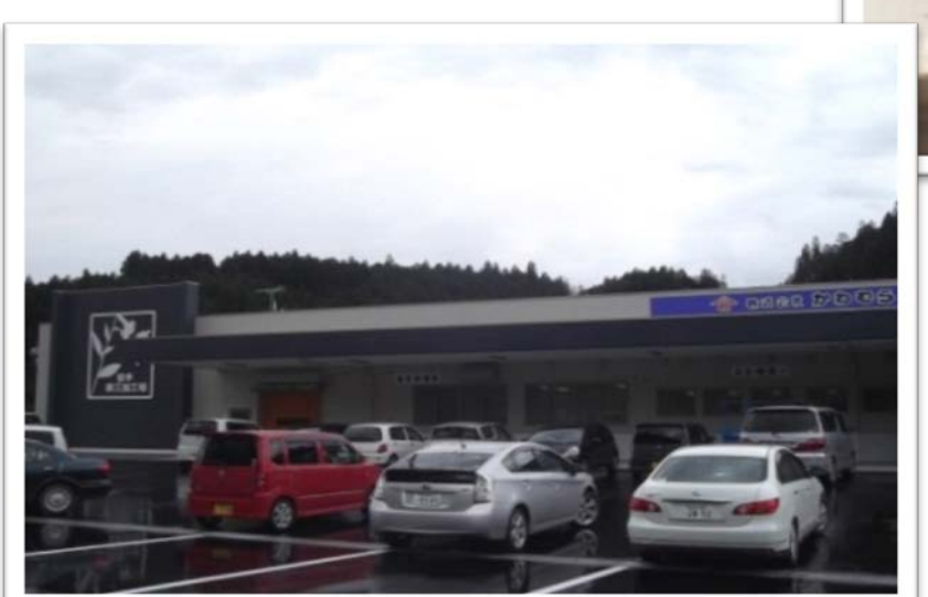
▲Fukkou Kirari Shopping area (Ozuchi town)

■ Sermon processing factory rehabilitated (Rikuzentakata city, Iwate pref)