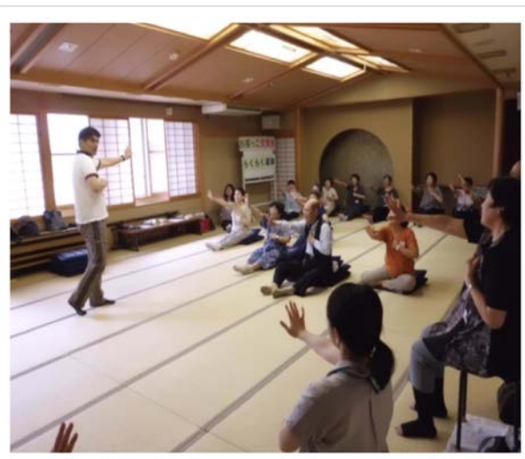
▲ Community revive support in an exchange facility