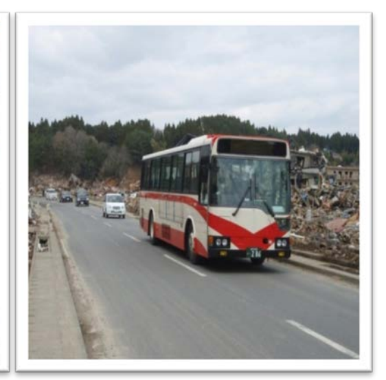
▲ Secure regional public transport