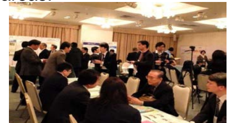
Exchange among members