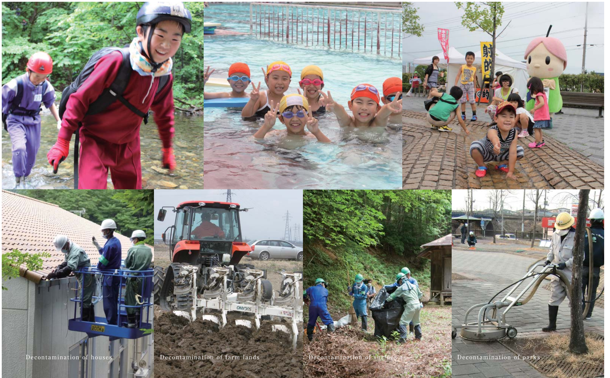
Decontamination of houses